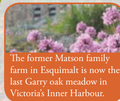
The former Matson family farm in Esquimalt is now the last Garry oak meadow in Victoria's Inner Harbour.

Government scraps all nature programs in Provincial Parks. 4000 children don't witness Goldstream Salmon Run.