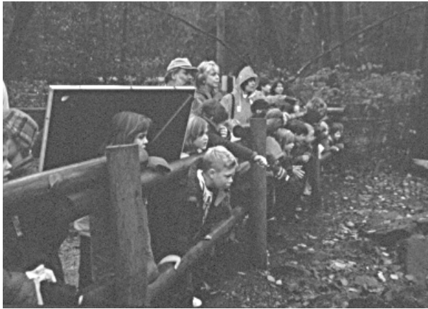
Students looking at the spawning Salmon during the education programs at Goldstream Provincial Park.